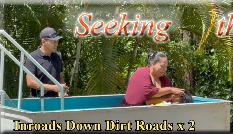
Inroads Down Dirt Roads x 2