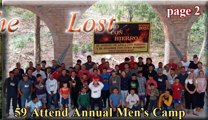
59 Attend Annual Men's Camp

CRC has grown. Since our last furlough in 2022, we finished the shower house, built the water tower, and extended the sports field. Also, this year we finished the roof and floor of the new open air chapel with its rain collection cistern as well as expanded the dining area of the retreat center. Our next endeavor will be dorms. We want to build three, four room units one at a time. Each room will hold seven to eight people. So each dorm section can hold up to 30 campers or four families.