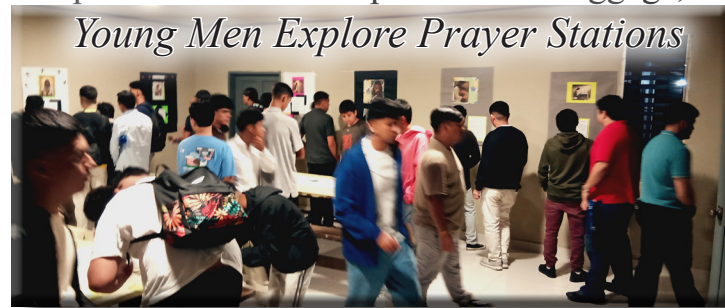
Young Men Explore Prayer Stations

We took two vehicles stuffed with 15 campers and one trailer packed with luggage,