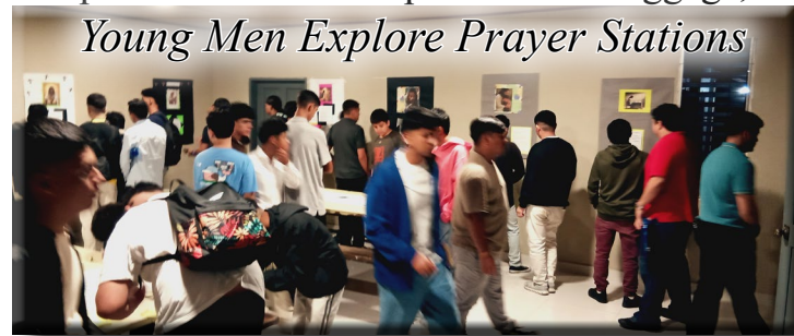
Young Men Explore Prayer Stations

We took two vehicles stuffed with 15 campers and one trailer packed with luggage,